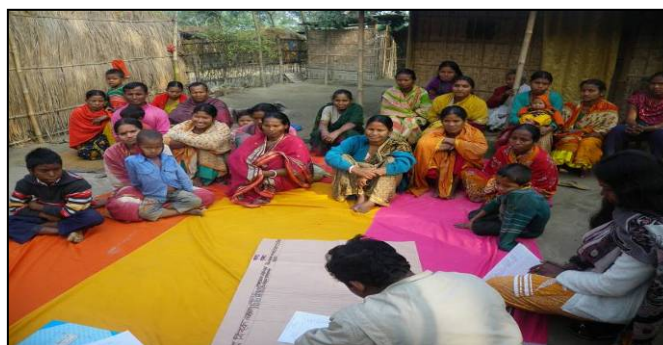
Annual PO Planning Sessions facilitated by PME Cell.

PME cell also implemented Input Monitoring: Training, Work Plan and Budget. Output monitoring: Samity, People's organizations, Capacity of Peoples Organizations. Outcome monitoring: partnership projects of POs. Access to Resources by the POs by developed various tools and formats.