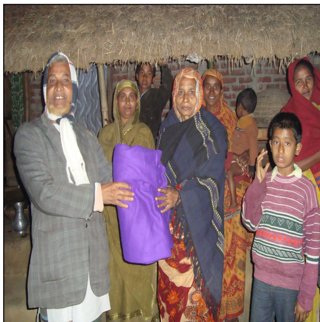
PO Leaders are distributing Blankets.

CDA works in the North West part Dinajpur and Thakurgaon Districts of Bangladesh with rural landless poor men, women including children and deprive people. The area is most vulnerable in terms of food scarcity and other livelihood means, as well as geographically base of Himalayas. People suffers very badly during this winter season December and January with extreme cold weather and the situation become very worst with frequent cold waves. During December 2009 to January 2010 CDA has distributed about 200 Blankets in Pirgonj, Ranisonkoil and Horipur Upazila of Thakurgaon districts among 200 People.